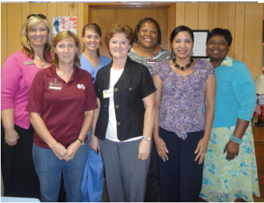
This is part of our Simpson County Coalition members. Our coalition would not be able to make the impact we try to make without passionate people like this!